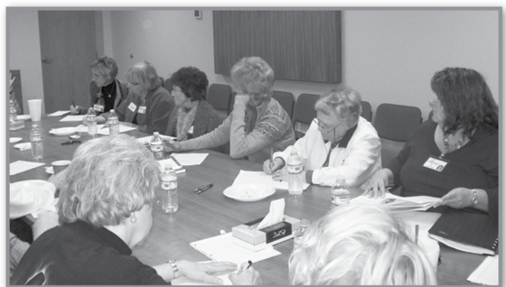
Volunteers are pictured in training for the Eleventh Hour Program at the Sherman office.