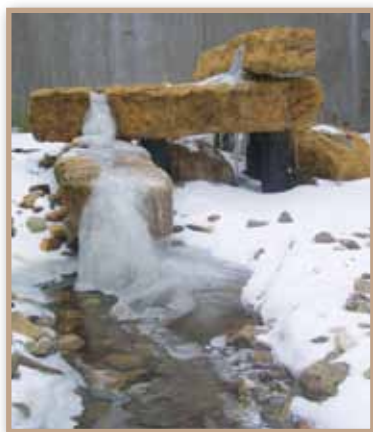
The water feature in our Memory Garden is pictured on Wednesday, February 3.

The volunteers in this program are all Patient Care Volunteers and, in addition, have gone through additional extensive training in the final hours of the end-of-life experience.