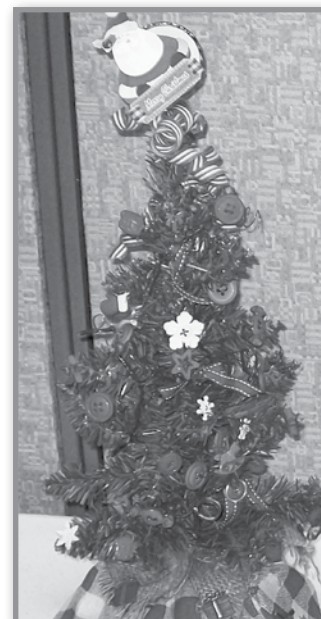
The staff at Home Hospice participated in a tiny Christmas tree decorating contest in early December. After judging by the Board of Directors and others, the trees were delivered to many of our patients.